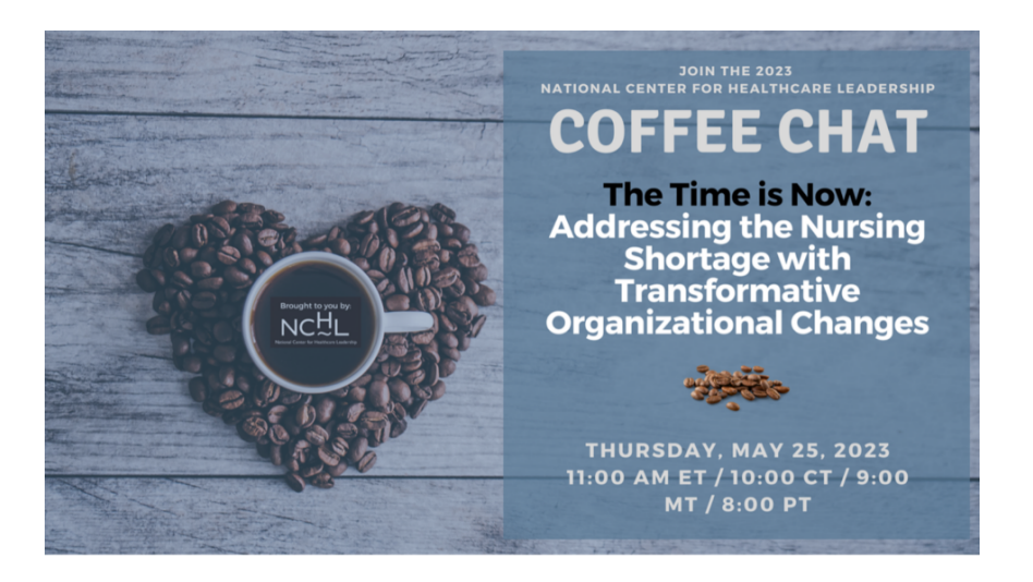
Please join us for the next NCHL Coffee Chat! The Time is Now: Addressing the Nursing Shortage with Transformative Organizational Changes